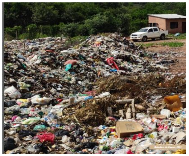
Fig. 1 Open Dump in the Municipality of Cuevo, before intervention.

It is one of the first experiences in the application of the National Planning for the Technical Closure of Landfills developed by the Ministry of Environment and Water, approved in May 2021.