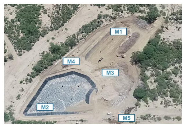
Fig. 3 Reference modules of the landfill closure and rehabilitation process, example Boyuibe.

meters, in the case of Boyuibe it is 20.5 \times 65 meters and in Cuevo the dimensions are 42 \times 55 meters.