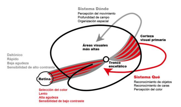
Fig. 2 The primate visual system, composed by the What (tan) system and the Where (blue) system. Livingstone, 2002.