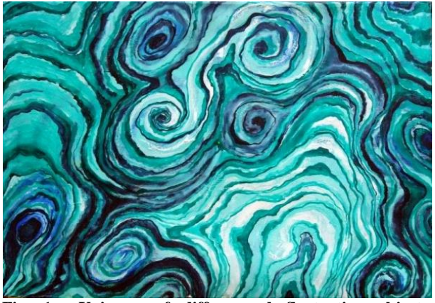
Fig. 1 Universe of diffuse and fluctuating objects, according to modern physics. Cuanalo, oil/canvas, 1.2 \text{ m} \times 1.5 \text{ m} , 2010.

From here it follows that the audience's experience facing the work of visual art is strongly mediated by the natural mechanisms of perception and interpretation and the visual information. Most of the color theory that has been taught at the art and design schools, is denied or, at least, adjusted by this knowledge about the perceptual mechanisms of vision.