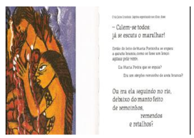
Figure 1 Text Form of the Book O Beijo da Palavrinha

As regards the text arrangement of the narrative, there are sentences in which very small font size letters are mixed with huge ones, mixing the moments when the characters and their actions are minimal, with some larger facts that are independent of their strengths. In addition, the text is arranged in a certain fashion to indicate the feeling or action of what the author wishes to narrate. A textual organization that resembles that of poetry: