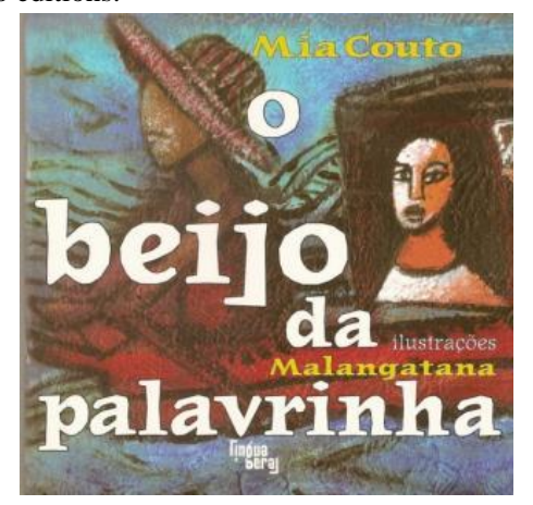
Figure 2 Book Cover of the Brazilian Edition

The reason is that the Portuguese edition brings much simpler pictures than the ones of the Brazilian edition, as can be seen on the covers of the two editions.