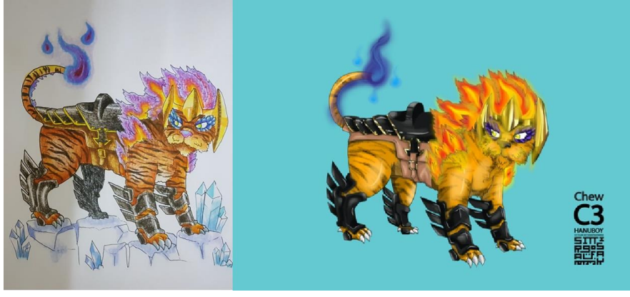
Figure 3 2D Toy "Chew" Art Characters Created Through This Concept