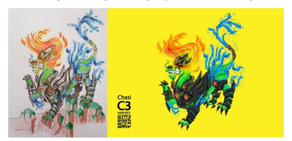
Figure 2 2D Toy "Chasi" Art Characters Created Through This Concept