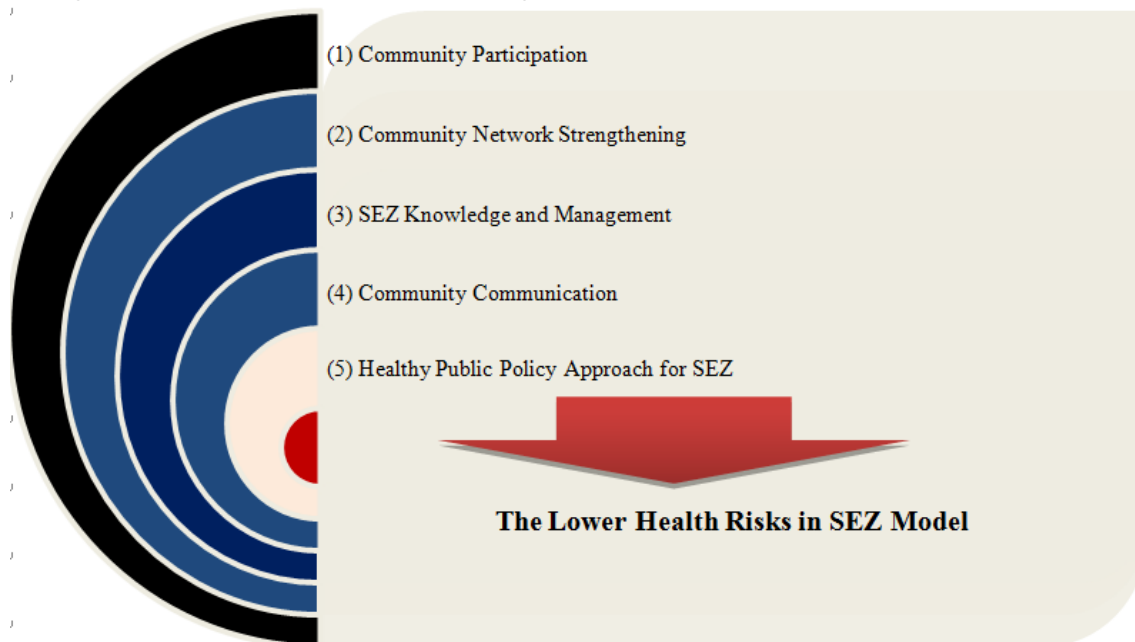
Figure 3 SEZ Performance and Community Health Management Model for SEZ

5) Healthy Public Policy: As the expected influx of industrial foreign workers and the number of international tourists into SEZs, Sadao, Songkhla, Thailand, it is recognized that this influx will also have impacts on society, environment, security, and public health such as the increasing of the prevalence of infectious diseases, workplace injuries, road accidents, and mental health problems in SEZ areas. These phenomena need to be constructed the healthy public policy to provide a framework for integrated health practices by communities together with all public health sectors such as health care services and local governments. The main features of the health management model for SEZ was shown in Figure 3.