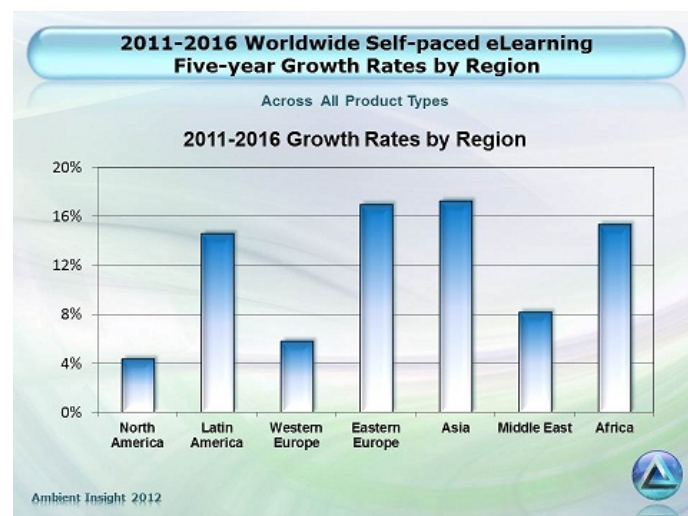
Figure 1 Growth Rates for 2011-2016 Global Macro-regions

The European Union in 2011, was the second largest market for e-learning, has a growth rate of 5.8% per annum, which leads from 6.1 billion dollars in 2011 to the expected 8.1 billion dollars of 2016. There are approximately 3 million students enrolled in online courses, half of whom were enrolled in Distance Teaching University and Open University, while the other half at traditional universities that offer distance learning courses.