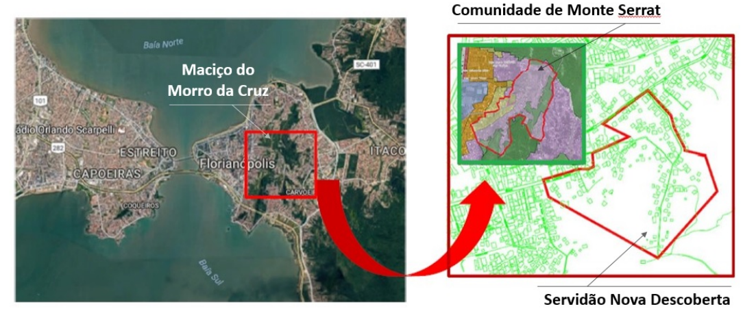
Fig. 1 Left: Maciço do Morro da Cruz view (red square), in Florianopolis, SC; Right: Monte Serrat community (green square) and Nova Descoberta Street (red polygon).

The study site selected for this research was a street called Nova Descoberta within Mont Serrat Community, one of the 18 tenements in MMC (Fig. 1). Nova Descoberta Street is in an environmentally vulnerable area, designated as a Limited Use Preservation Area (or APL in Portuguese acronym) by the Brazilian Forest Code.